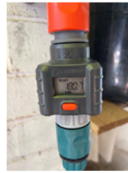
One Litre = 1 kilo

The longest part of the installation process usual is dealing with the water ballast - PLEASE make sure there is good access to taps, hoses and any keys needed for the taps.